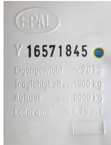
EPAL Box pallet (inscription plate)