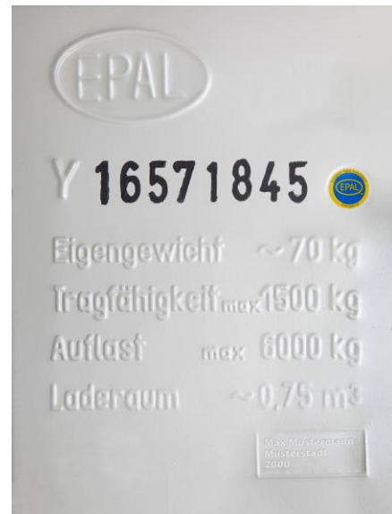
EPAL Box pallet (inscription plate)