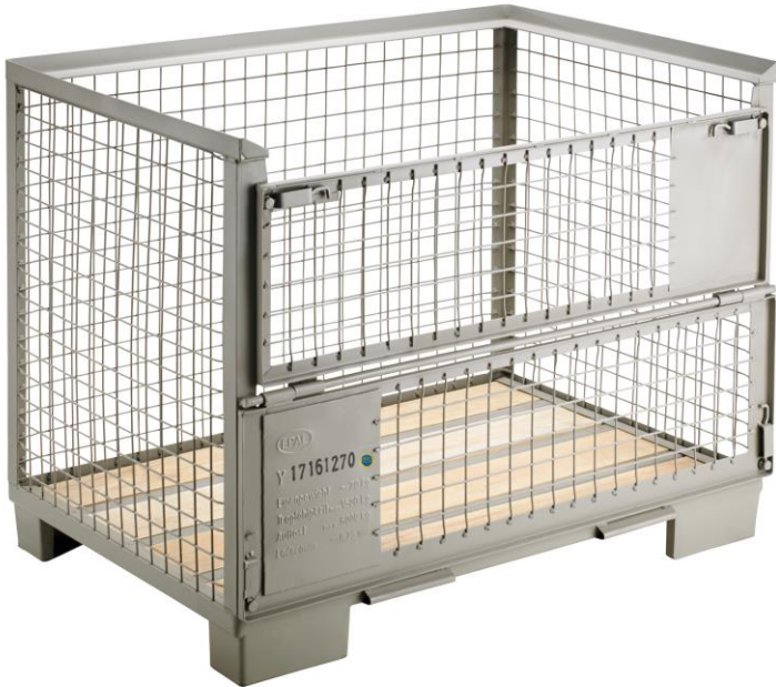
EPAL Box pallet